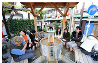
Public Footbath 'Yakushi no Yu'

Institute for Planetary Materials, Okayama University Misasa Onsen Environment and Society (Session 5)