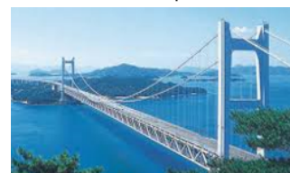
Seto Ohashi Bridge