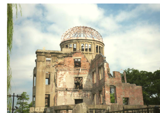
Hiroshima Peace Memorial

Cultural Experience Program (Optional) Individual Trip (Optional)